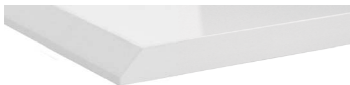
Bevel Edge Door NEW

Designed for a sleek, modern and minimalistic look creating clean flowing lines.