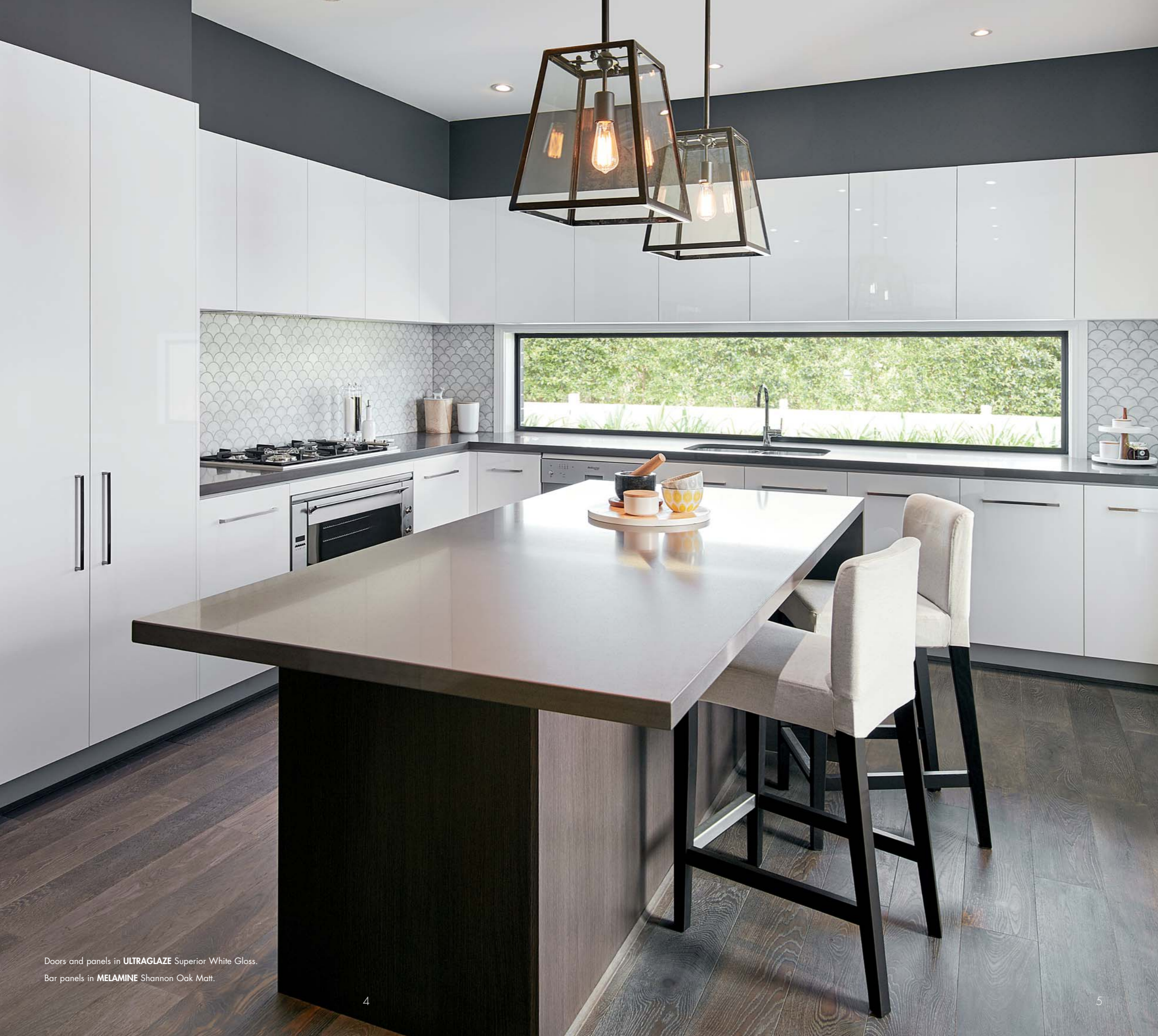
Doors and panels in ULTRAGLAZE Superior White Gloss. Bar panels in MELAMINE Shannon Oak Matt.