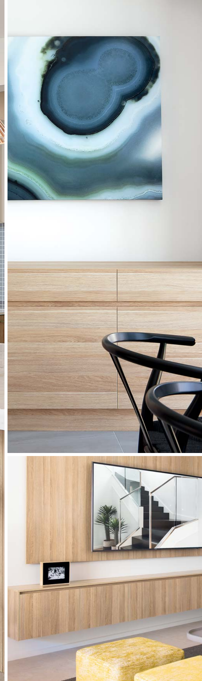
Doors and panels in RAVINE Natural Oak. Overhead cupboard doors in MELAMINE Classic White Matt.