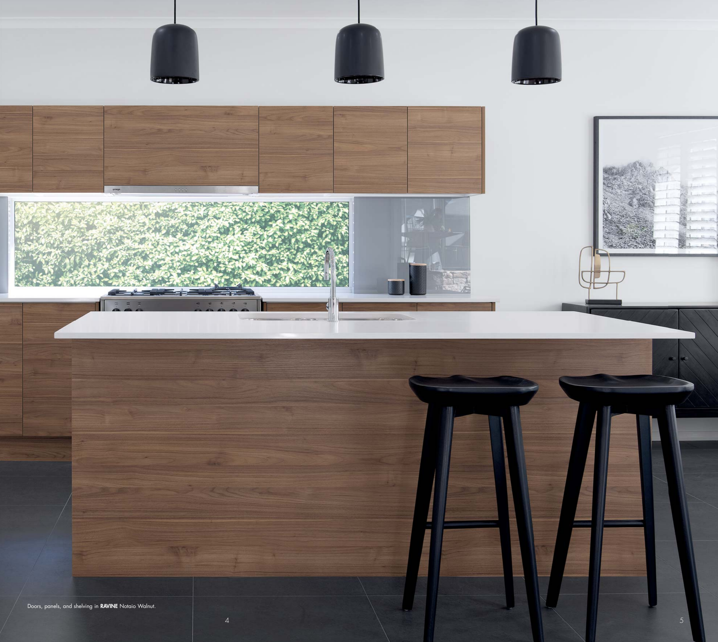
Doors, panels, and shelving in RAVINE Notaio Walnut.