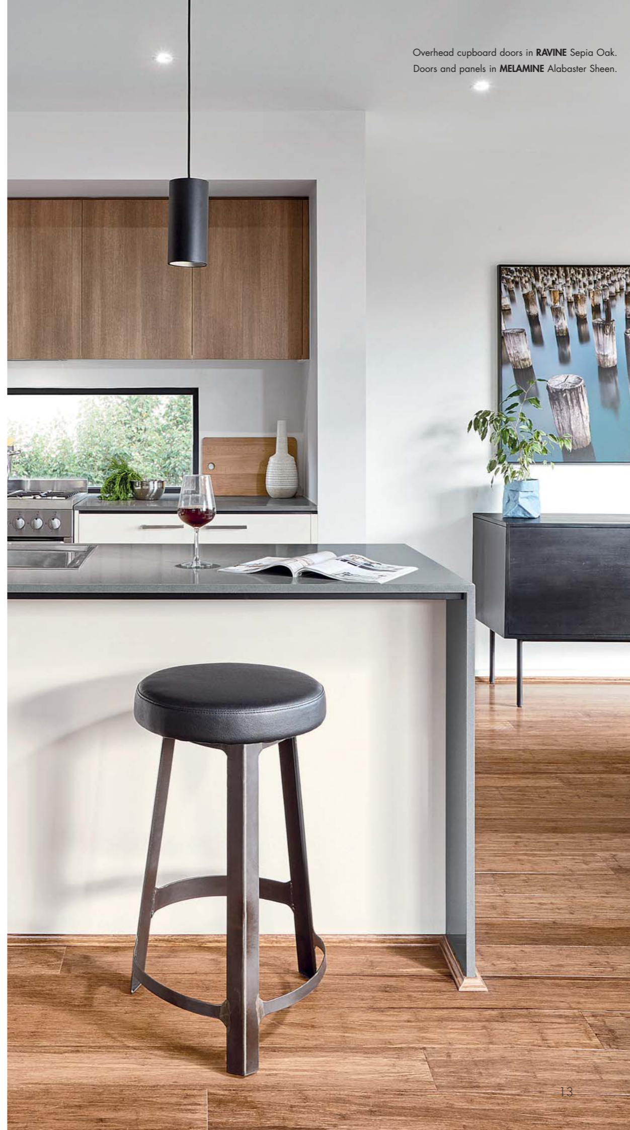
Overhead cupboard doors in RAVINE Sepia Oak. Doors and panels in MELAMINE Alabaster Sheen.

Dark coloured surfaces will show fingerprints and require more care and maintenance than lighter coloured surfaces. It is recommended to test a product sample prior to colour selection.