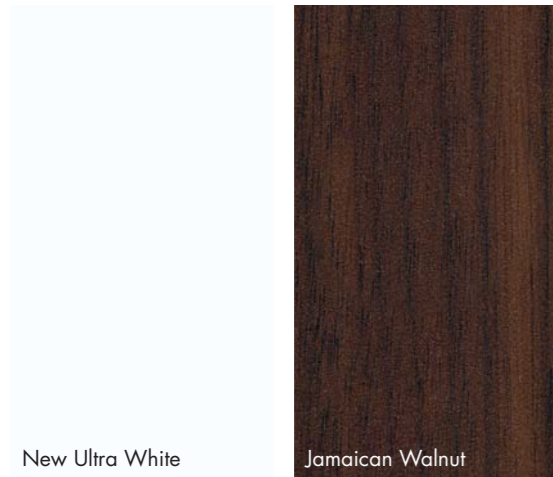
New Ultra White