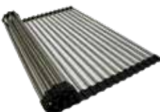
UNIVERSAL DRAINER MAT