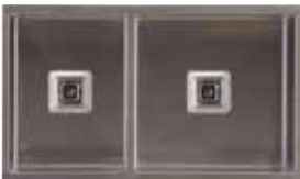
SQUARELINE 1 & 3/4 Bowl sink