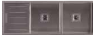
SQUARELINE Double bowl sink