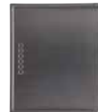
SQUARELINE Drainer tray