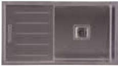
SQUARELINE Single bowl sink