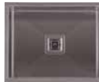
SQUARELINE Laundry sink