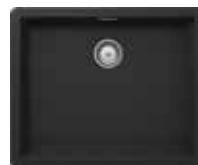
QUARTZ COMPOSITE SINK Single bowl laundry sink