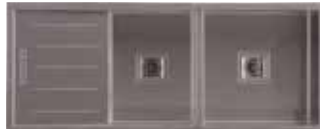
SQUARELINE 1 & 1/2 Bowl sink