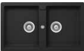
QUARTZ COMPOSITE SINK Double bowl sink