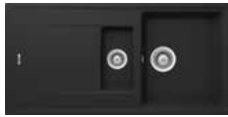
QUARTZ COMPOSITE SINK 1 & 1/4 Bowl sink with drainer