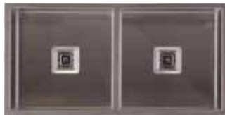
SQUARELINE Double bowl sink