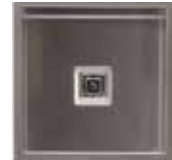
SQUARELINE Single bowl sink