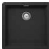
QUARTZ COMPOSITE SINK Single bowl