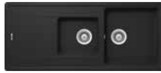
QUARTZ COMPOSITE SINK 1 & 3/4 Bowl sink with drainer